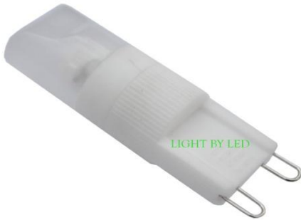
G9 1 Watt

SKU: L-G9-1.0W-CW-150-AN (Cool White) L-G9-1.0W-WW-150-AN (Warm White)