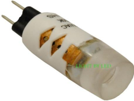
G4 1.5 Watt 12V

SKU: L-G4-1.5W-CW-120-AC-PE (Cool White) L-G4-1.5W-WW-120-AC-PE (Warm White)