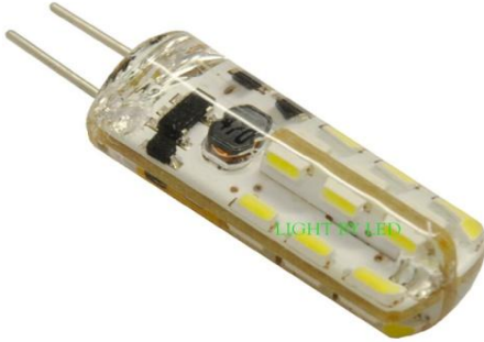
G4 1.5 Watt 12V

SKU: L-G4-1.5W-CW-360-ACDC-PE (Cool White) L-G4-1.5W-WW-360-ACDC-PE (Warm White)